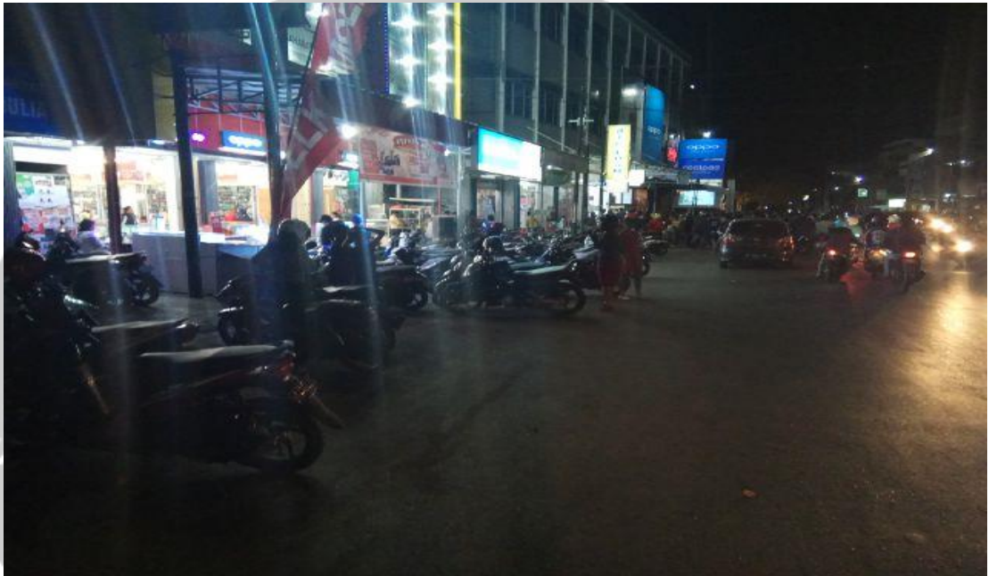
Gambar 5. Kondisi parkir pada malam hari