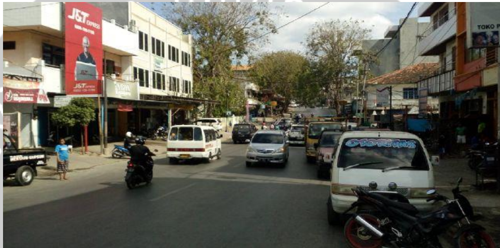
Gambar 1. Kondisi arus lalu lintas pada siang hari