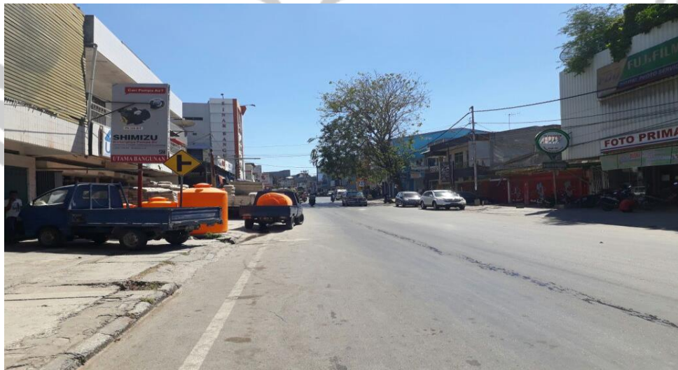
Gambar 2. Kondisi arus lalu lintas pada sore hari