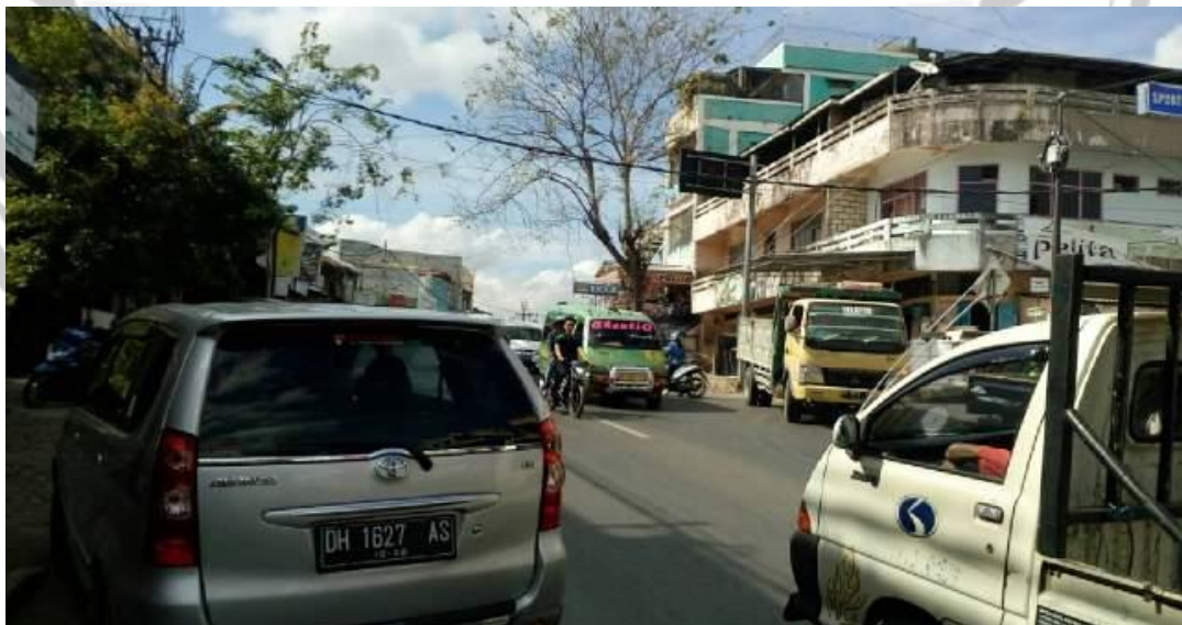
Gambar 4 Kendaraan berat yang melewati ruas jalan