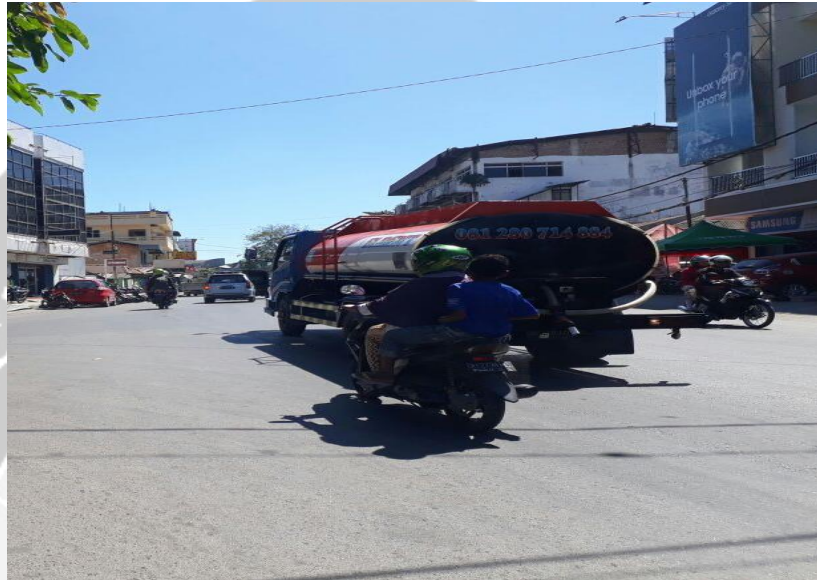
Gambar 3. Kendaraan berat tanki air