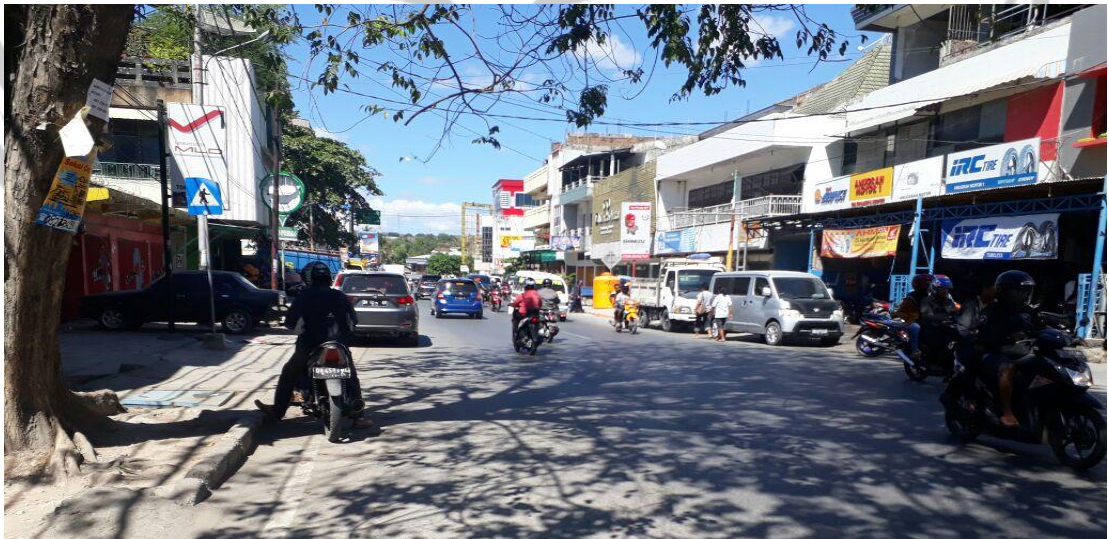
Gambar 6. Kondisi parkir di kedua sisi jalan