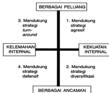
Figure 1. Framework of A SWOT Analysis

In this case, the SWOT technique is concerned with planning, strategy, vision, and mission of the company, of course, in this case a SWOT analysis will lower even end exist threats and weaknesses. On the SWOT of research designed to find out which company it is of course obtained based on the interview against the owner of the E-Marketplace Dipeta companies.