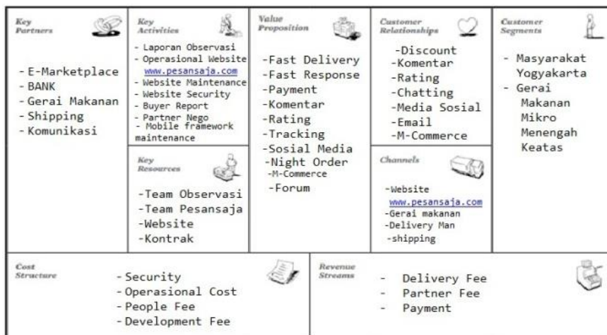
Figure 4. Apply Business Model Canvas at the E-Marketplace www.pesansaja.com

As already explained earlier that the results of evaluations already carried out will be the main basis of make new business models in the E-Marketplace in Figure 4.