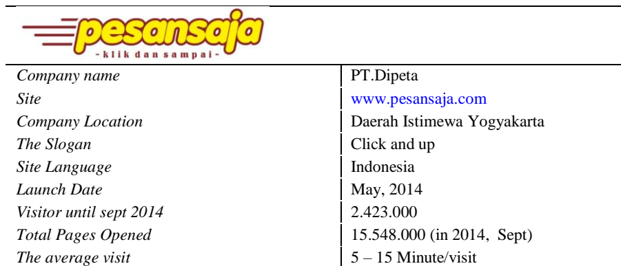
Table 1. Company Profile E-Marketplace

To know the development of the company, this article is also in the show data visitors or consumers of in the city of Yogyakarta. Data obtained from the website www.pesansaja.com .