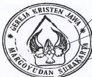
Dkn. Sas. Her Upadi