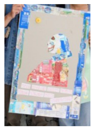
Figure 8. Visual creation using plastic packaging

Students are invited to explore learning materials through various visual art practices and experiments. Visual art exploration presents visual artist Made Bayak, who explores used plastic labels or packaging into art. The exploration of visual arts is carried out in groups, where these group work practices encourage students to communicate and interact with one student and others. The practice of communication and interaction helps to liven up the class and open intercultural communication, both in the context of the diverse students' backgrounds from which students come to Deaf culture and Hearing culture.