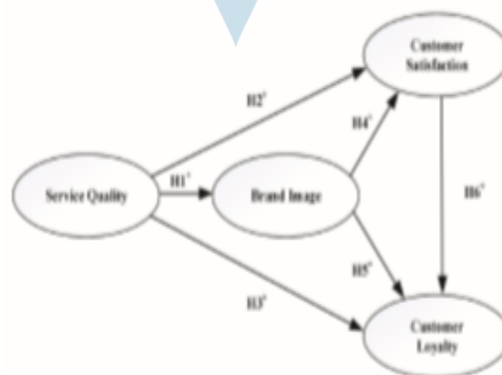
Figure 1: The Proposed Conceptual Model

The concept of customer loyalty has happened in many discussions in the literature with different definitions. Jacoby and Kyner (1973) were described customer loyalty as the tended (i.e., non-random), behavioral reply (i.e., buying), demonstrated over time, by some decision-making unit, concerning one or more alternative brands out of a collection of such brands, and was a role of psychological (i.e., decision making, evaluation) processes (Jacoby & Kyner, 1973). Customer loyalty was defined as the strength of the relationship between a clients' relative attitude and repurchase trade (Dick & Basu, 1994). Customer loyalty also was described as a strong continued commitment to repurchase or patronize a favored product/service consistently in the future, thereby creating repeated same-products/brands purchasing (Oliver, 1997). Customer loyalty was explained as a combination of clients' favorable attitudes and rebuy behavior (Kim et al., 2004). Customer loyalty has been identified as the principal factor in a business firm's success (Yap et al., 2012). The importance of customer loyalty was closely linked to the business's continued survival and the influence of future growth (Kim et al., 2004).