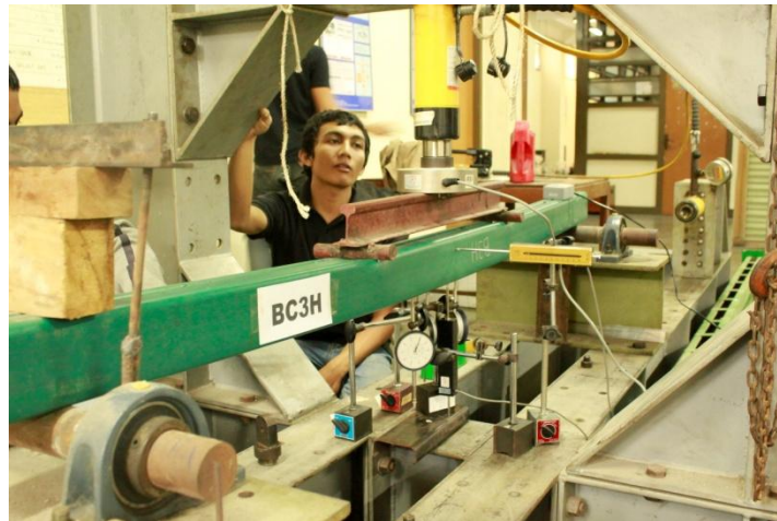
Pengujian Balok Baja Profil C Gabungan dengan Jarak Variasi Sambungan Las 3H (BC3H)