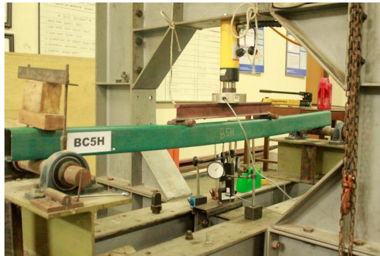
Pengujian Balok Baja Profil C Gabungan dengan Jarak Variasi Sambungan Las 5H (BC5H)