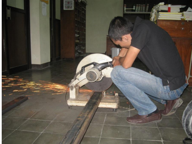
Proses Pemotongan Baja Profil C