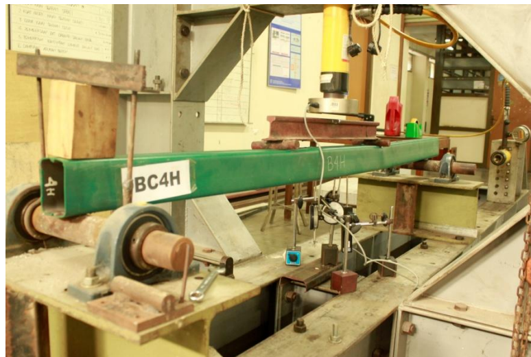
Pengujian Balok Baja Profil C Gabungan dengan Jarak Variasi Sambungan Las 4H (BC4H)