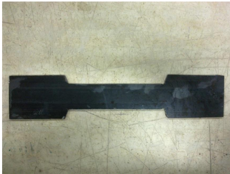
Sampel Baja Profil C Sebelum Diuji