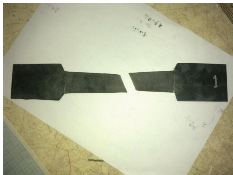
Sampel Baja Profil C Setelah Diuji Tarik