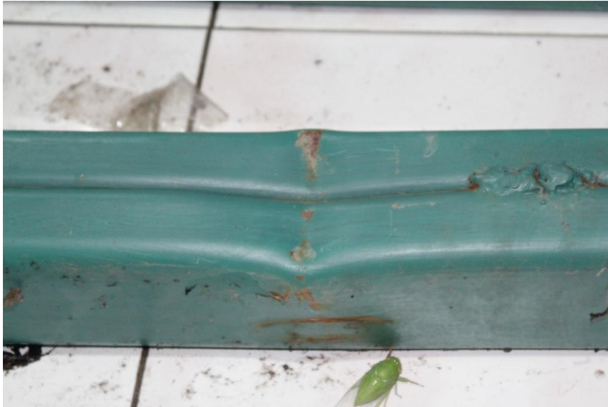
Kerusakan Benda Uji Pada Tumpuan Beban