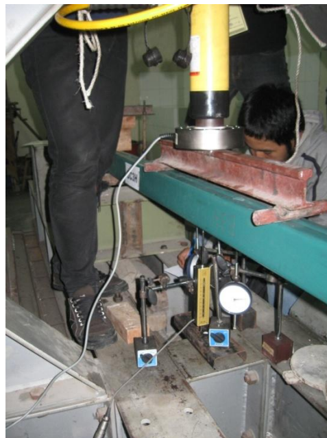
Posisi Pemasangan Dial pada Pengujian Balok Baja Profil C Gabungan