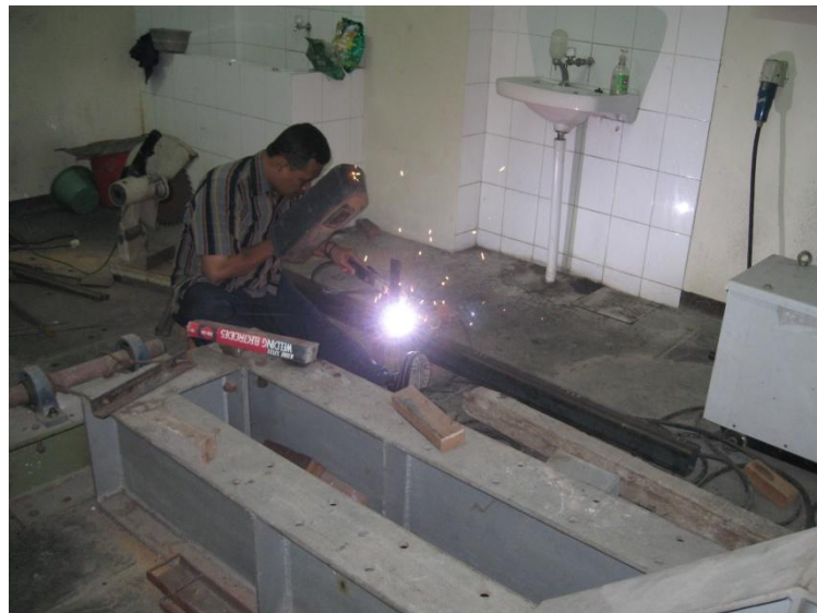
Proses Pengelasan Kolom Baja Profil C Gabungan