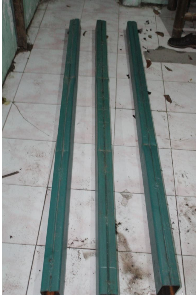
Benda uji setelah dilakukan pengujian